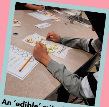
An 'edible' mitosis lab at AHS