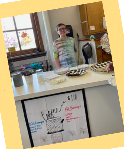
AJHS Coffee Cart