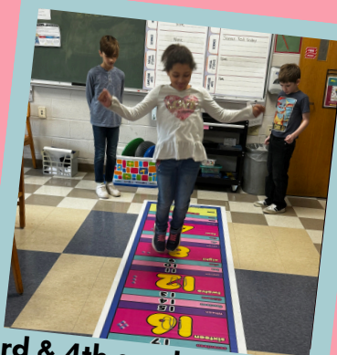
3rd & 4th graders using the 4s mat in math