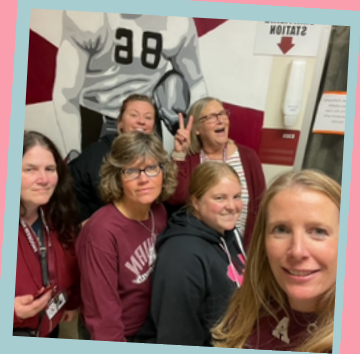
Teacher Aide PD