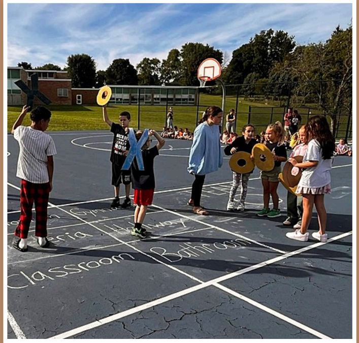
Students at Casey Park were very happy to be back in school on the first day of school!