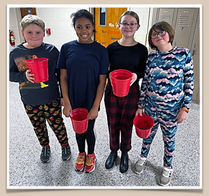
We are excited to share that our students and staff collectively raised over $600 for the Sleep in Heavenly Peace fundraiser. These donations will help provide beds for children in our community. Thank you to everyone who contributed!