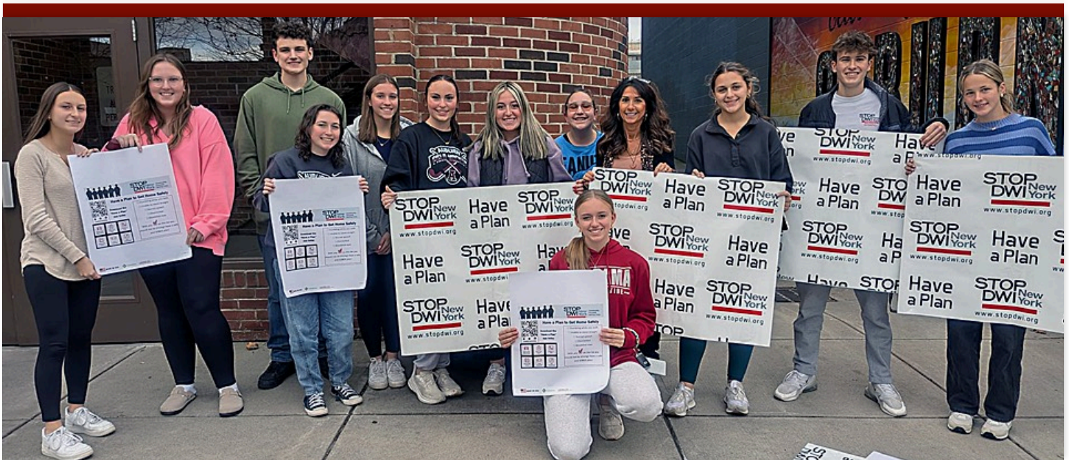
The AHS SADD Club put liners over trash cans in downtown Auburn to help promote anti-DWI efforts. Club members also put up posters in some downtown businesses. With the holidays coming up, this is an important message to be aware of, don't drink and drive.