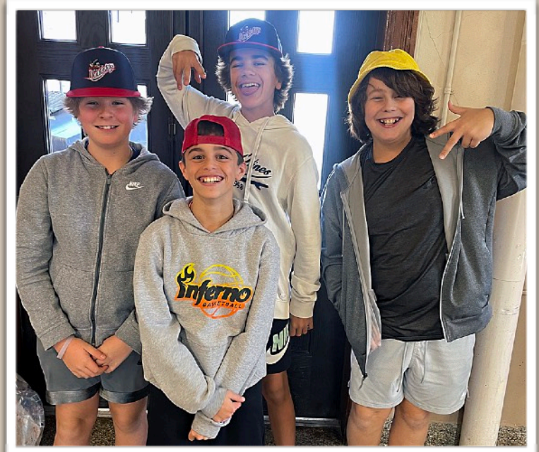
A Hat Day Fundraiser was held on November 8th at AJHS by the National Junior Honor Society.