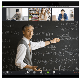
High Quality Instruction